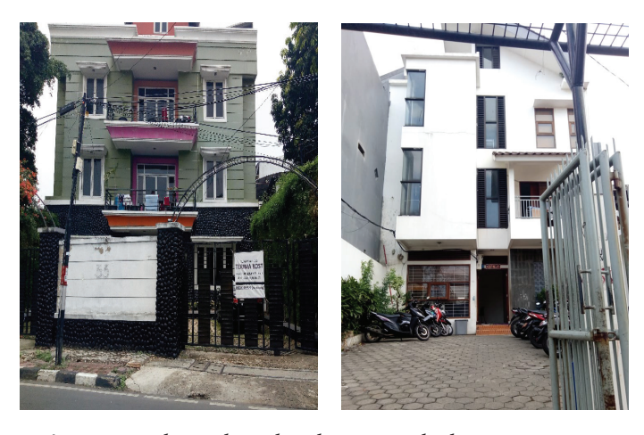
Figure 2. Exclusive boarding houses in the kampung

There are 75 exclusive boarding houses spread across the eight RW (Community Unit) in Paseban. The exclusive boarding houses are