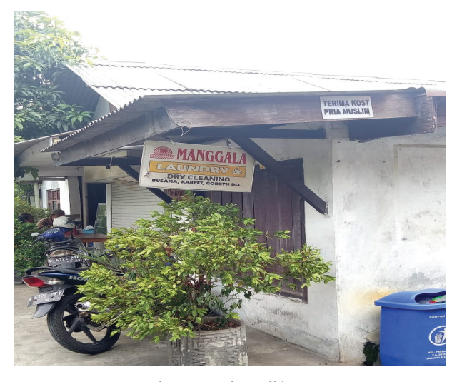
Figure 7. Laundry, one of small business in Kampung Paseban

unable to catch up with the urban style that newcomers tend to have.